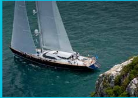
Janice of Wyoming