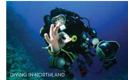
DIVING IN NORTHLAND